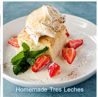
Homemade Tres Leches

*Consuming raw or undercooked meats, poultry, seafood, shellfish, or eggs may increase your risk of foodborne illness, especially if you have certain medical conditions.