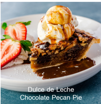
Dulce de Leche Chocolate Pecan Pie

served warm with vanilla ice cream & homemade cajeta sauce 8.95